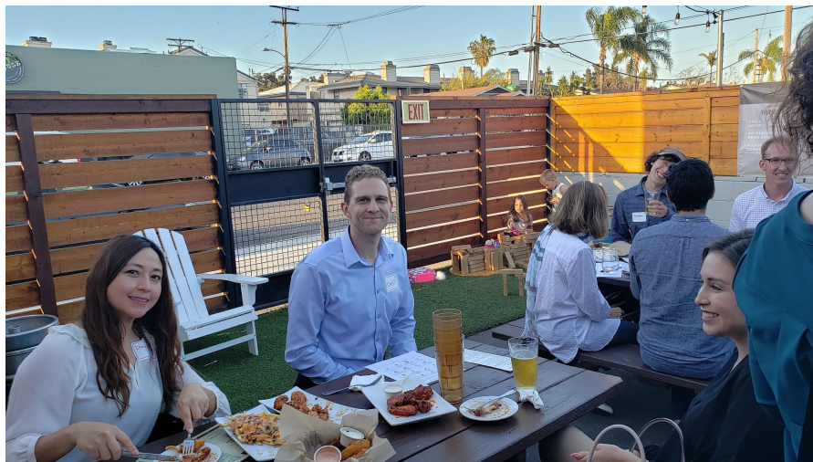
2018 YEP Mentorship Program event at Newtopia Cider