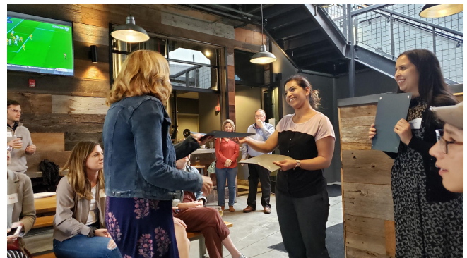
2018 YEP Mentorship Program End-of-Year Celebration at 10 Barrel Brewing