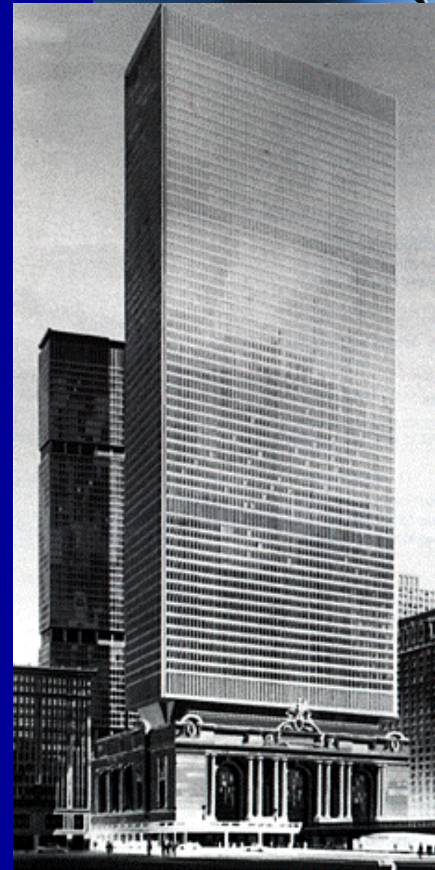
Penn Central Terminal Building