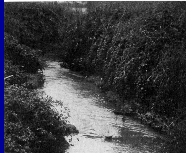
Improvements in Dolan