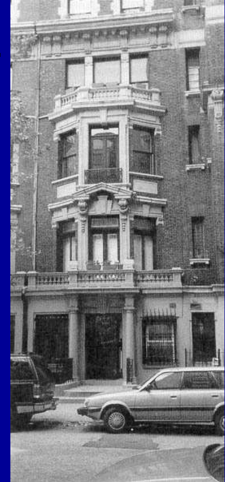
Building involved in Loretto